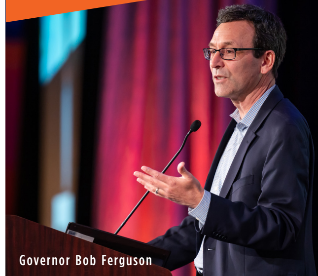
Governor Bob Ferguson