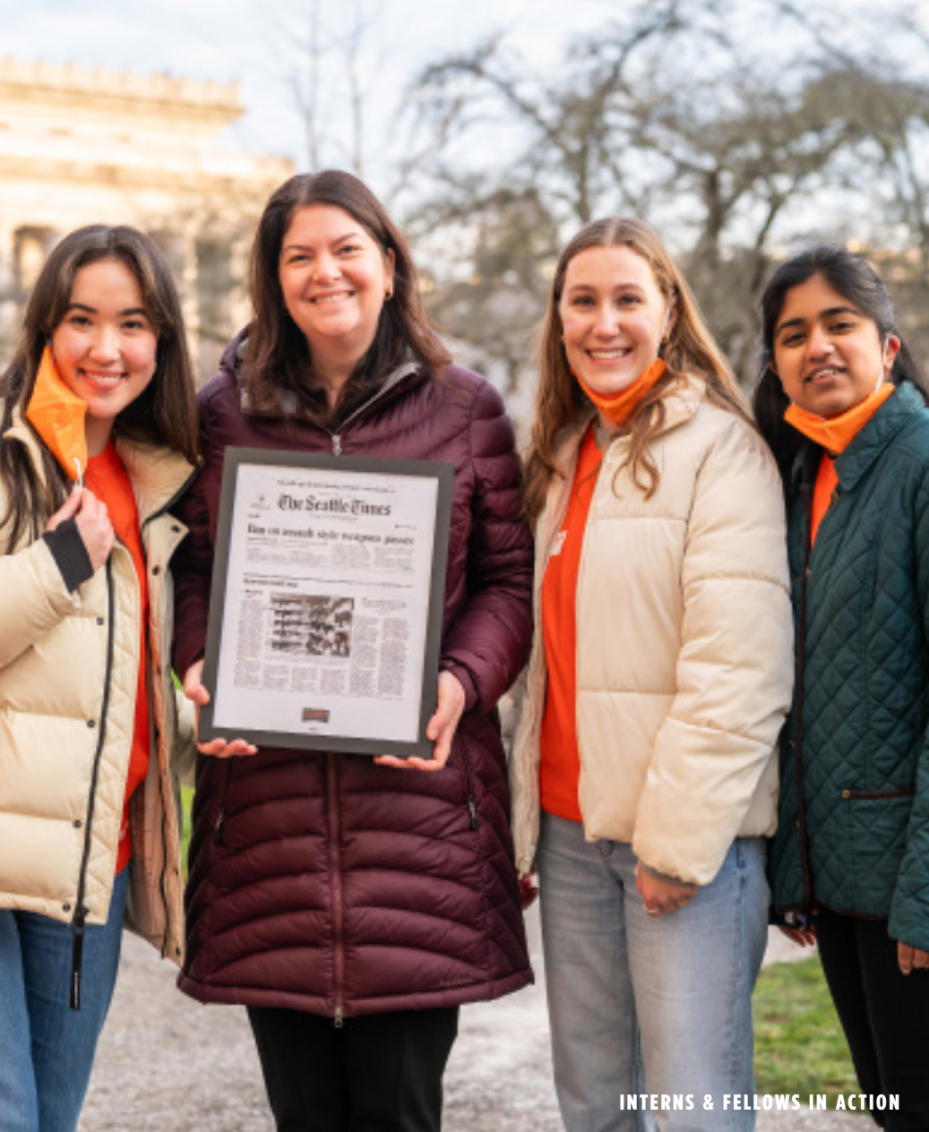
INTERNS & FELLOWS IN ACTION